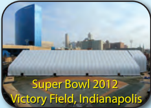
Super Bowl 2012 Victory Field, Indianapolis

50 Years Celebration of the Aga Khan Leadership