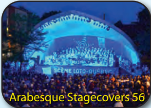
Arabesque Stagecovers 56