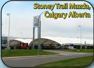
Series 37, 127'x400'