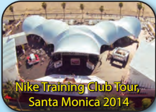
Nike Training Club Tour, Santa Monica 2014

Roundhouse Theatre Installed by All Shelter Sales & Rentals