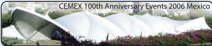
CEMEX 100th Anniversary Events 2006 Mexico

Tents for all Reasons... Tents for all Seasons.